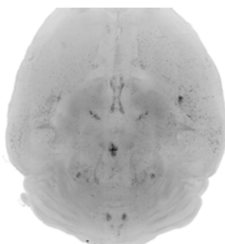
Brain-wide c-Fos expression following acute drug administration in the mouse.

Send us the brains – our 3D c-Fos imaging platform is applicable to any relevant in vivo model in the mouse.